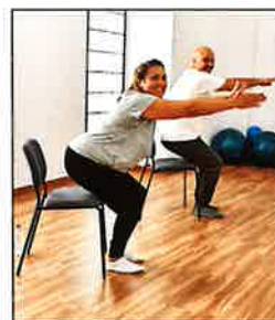
Sit to Stand