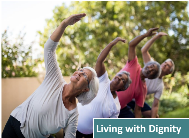
Living with Dignity