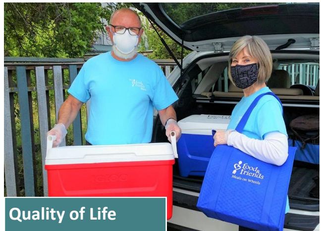
Quality of Life