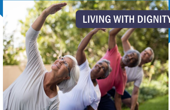
LIVING WITH DIGNITY