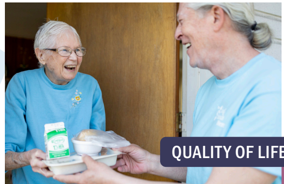
QUALITY OF LIFE