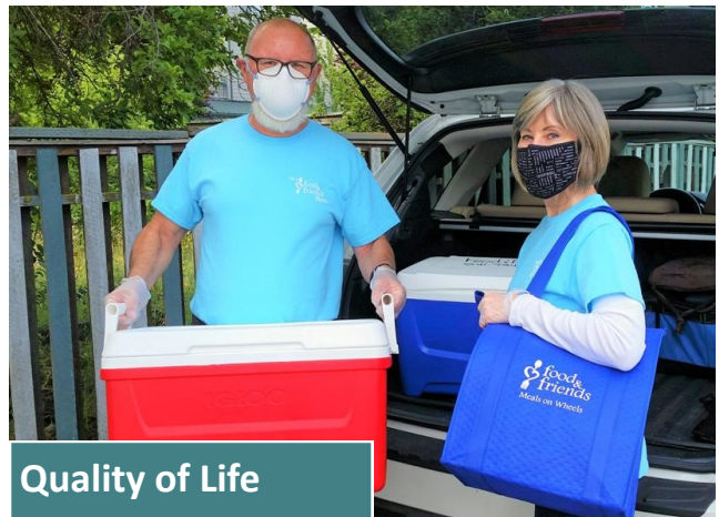
Quality of Life