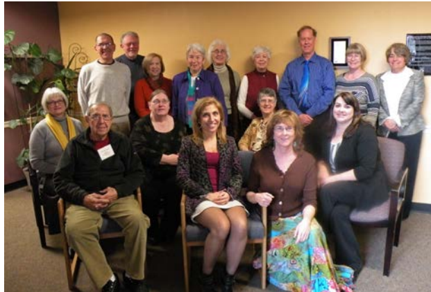
Advisory Council Members